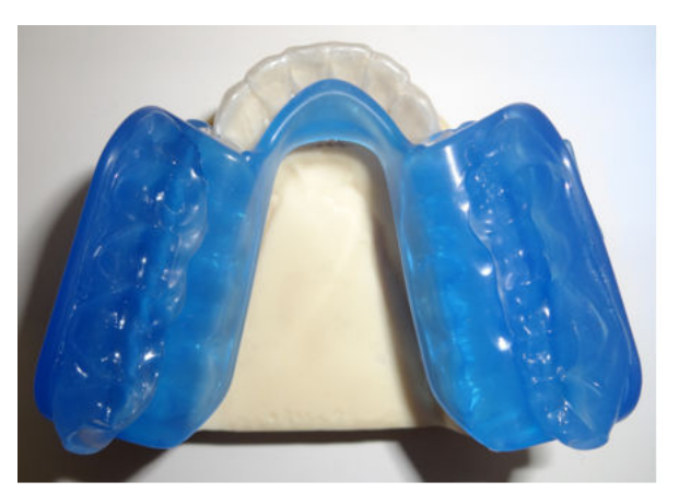
The Moses Express lower component formed over lower vacuum formed retainer.